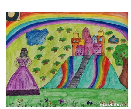
Smrutirani Tarai (VI)